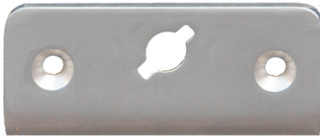
2 x LEFT Hand Brackets (A)