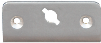
2 x RIGHT Hand Brackets (B)