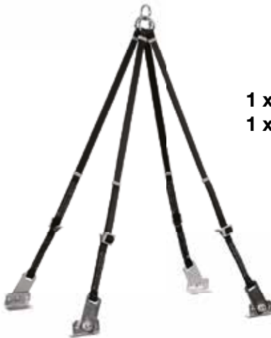
1 x Adjustable Sling