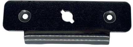
2 x RIGHT Hand Brackets (B)