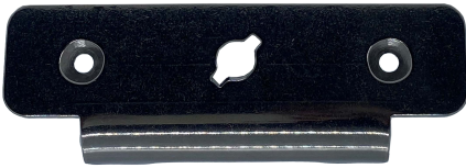
2 x LEFT Hand Brackets (A)