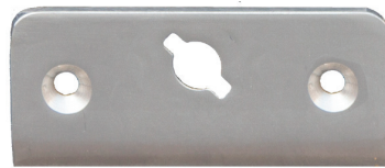
2 x RIGHT Hand Brackets (B)