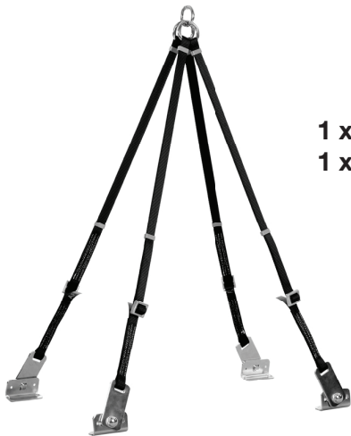
1 x Adjustable Sling 1 x Storage Bag